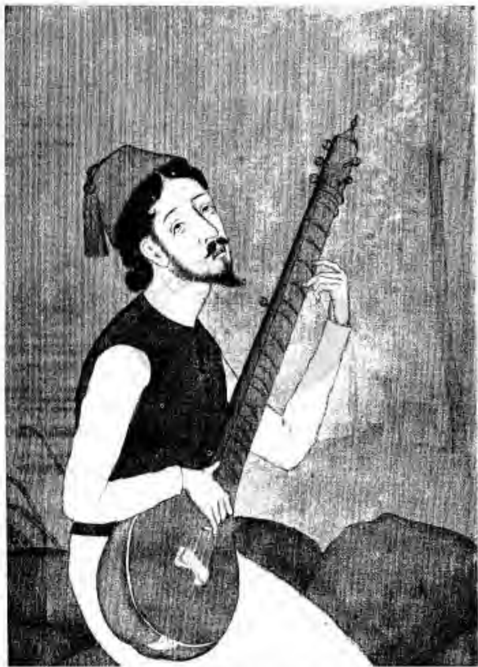
"When the young man finished his music he heaved a deep sigh."